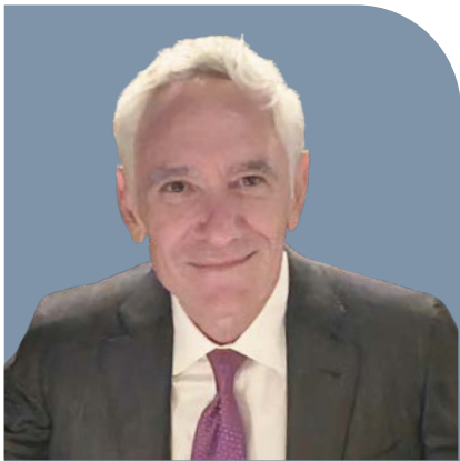
Scott W. Atlas

Co-Founder, Global Liberty Institute; Robert Wesson Senior Fellow Hoover Institution Stanford University