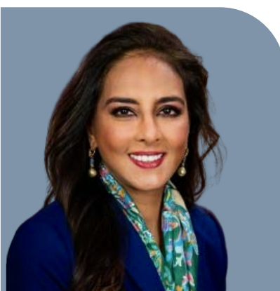
Harmeet K. Dhillon

Co-Founder, Global Liberty Institute; Robert Wesson Senior Fellow Hoover Institution Stanford University